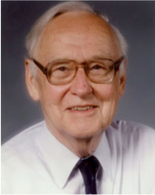
James Crow

The “greatest mutational health hazard to the human genome is fertile older males” -- James Crow